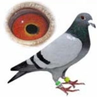
12 VK 6055

Kleine Figo & Thone's Poco Superman, Sars, Napoleon Janssen line combine Won 25th A. speed in A. 6 race Won 9th place 500 miles race 760 ypm, WAC Race, 2012 Dau 16205 won 1st 150 miles @1553ypm